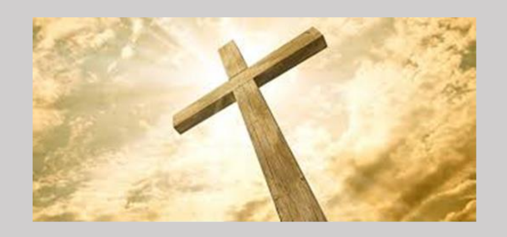
The Gospel vs. the Colossian Heresy (Colossians 2:6-15)