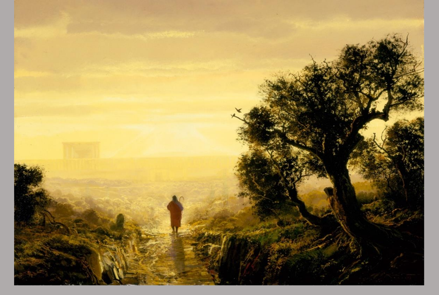
The Road to Jerusalem