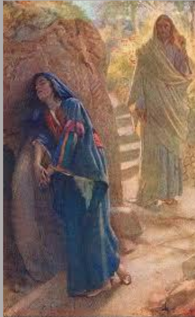
Mary Magdalone and Risen Christ by Harold Copping