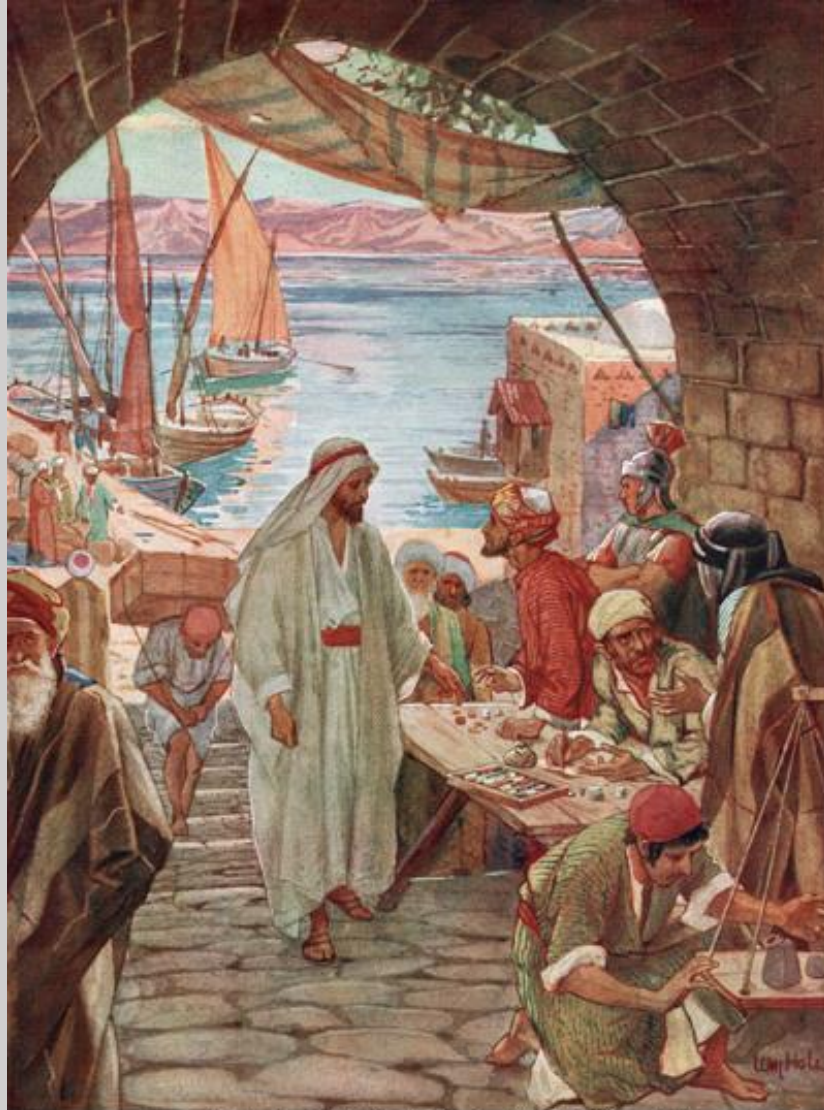
Jesus Calls Levi To Be A Disciple by William Hole