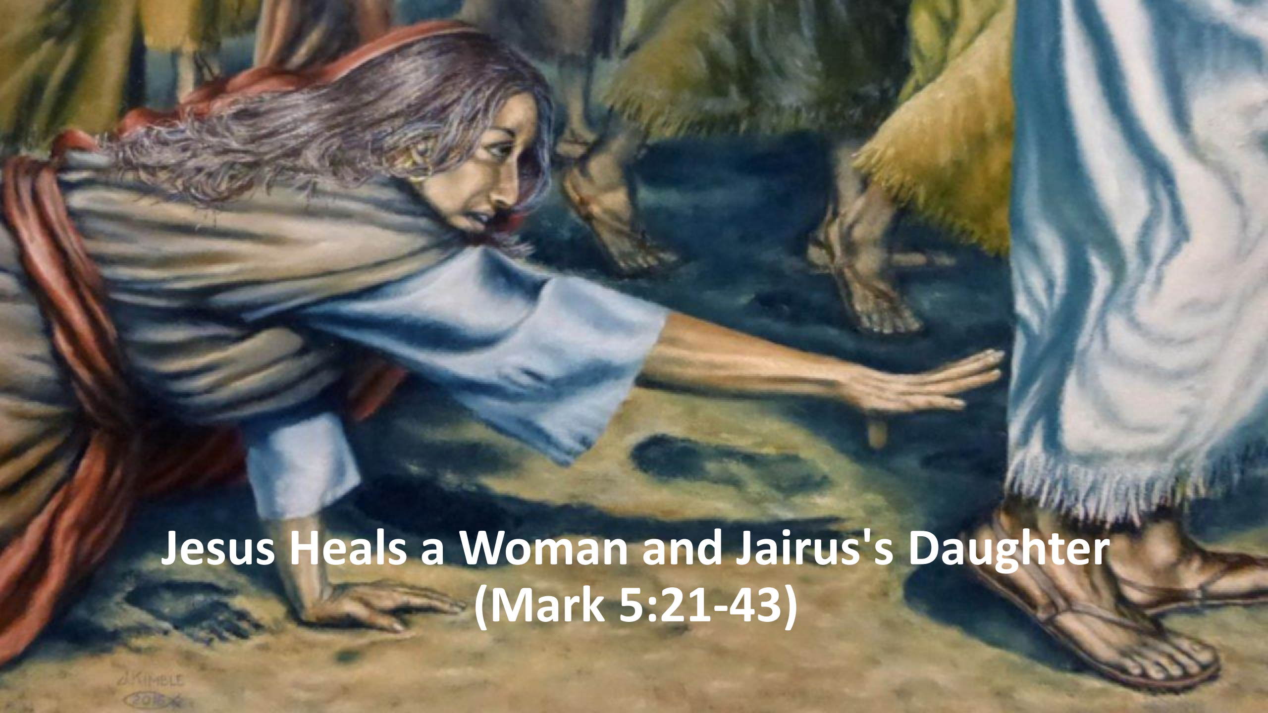
Jesus Heals a Woman and Jairus's Daughter (Mark 5:21-43)