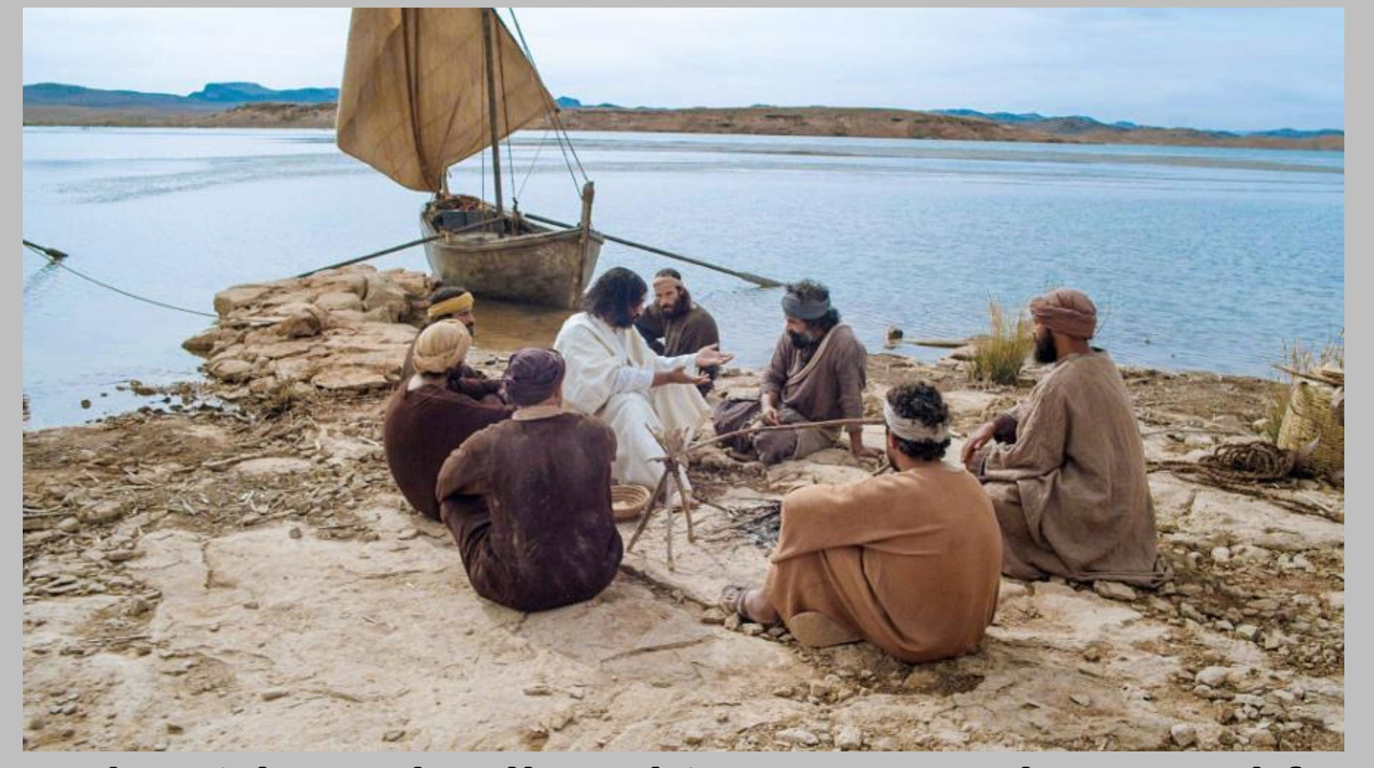
Food, Faith, and Fellowship: Jesus Makes Breakfast (John 21:1-14)