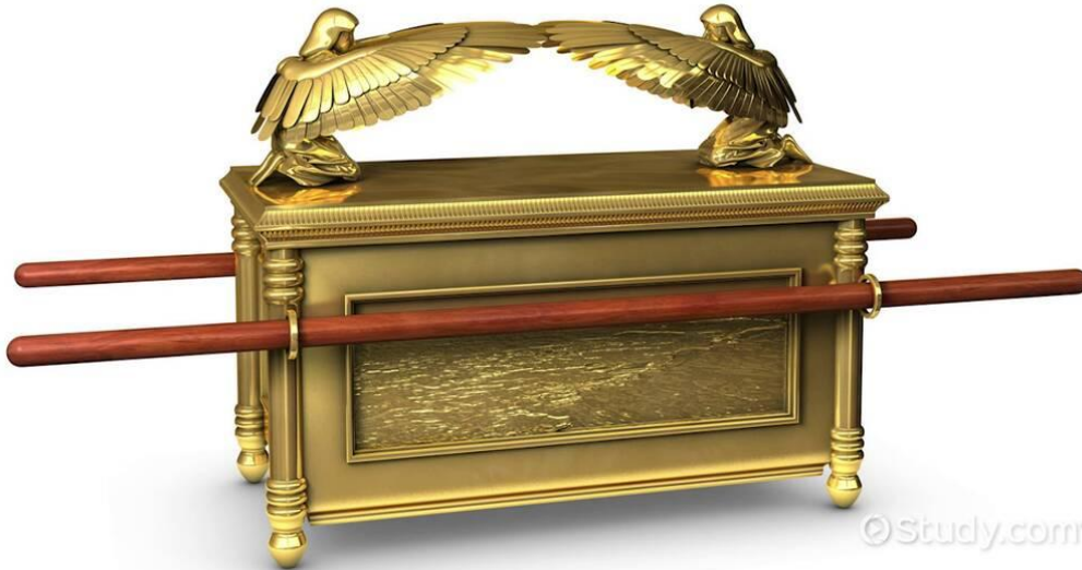
THE ARK OF THE COVENANT