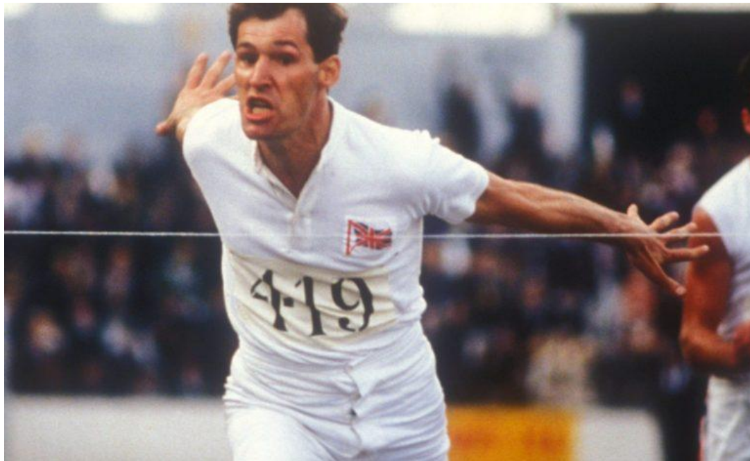
Eric Liddell (400 meters)