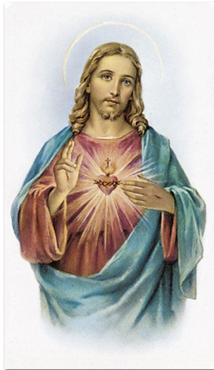
A Devotional Card